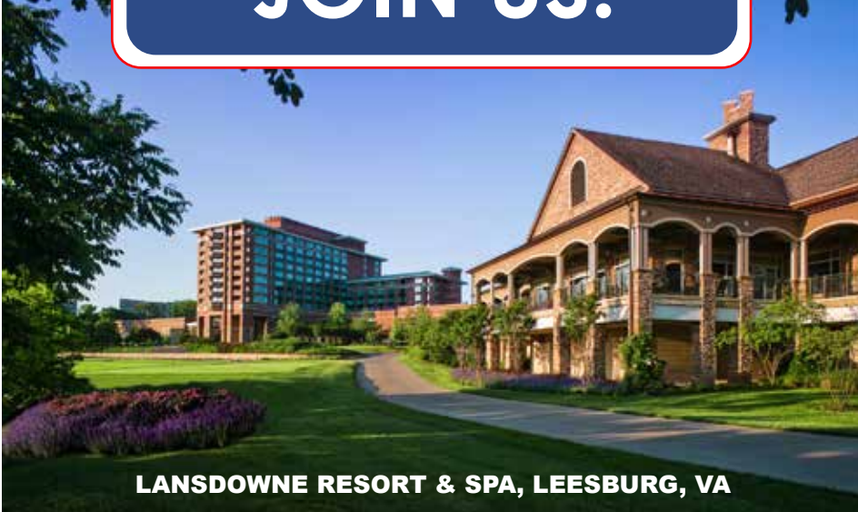
LANSLOWNE RESORT & SPA, LEESBURG, VA

THE VIADA ANNUAL CONVENTION & EXPO is the premier education and networking forum for dealers all over the state of Virginia. Showcase your services and products directly to your target market: Dealers! Demonstrate how your company's product/service will benefit them and help them to be more successful.