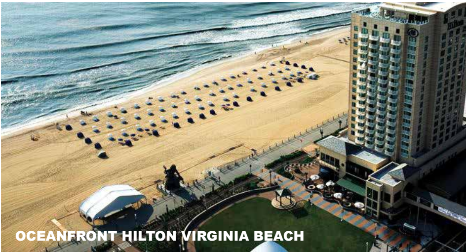
OCEANFRONT HILTON VIRGINIA BEACH

THE VIADA ANNUAL CONVENTION & EXPO is the premier education and networking forum for dealers all over the state of Virginia. Showcase your services and products directly to your market segment and show the way your products/services benefit the independent dealer. Your products help the dealers be more successful.