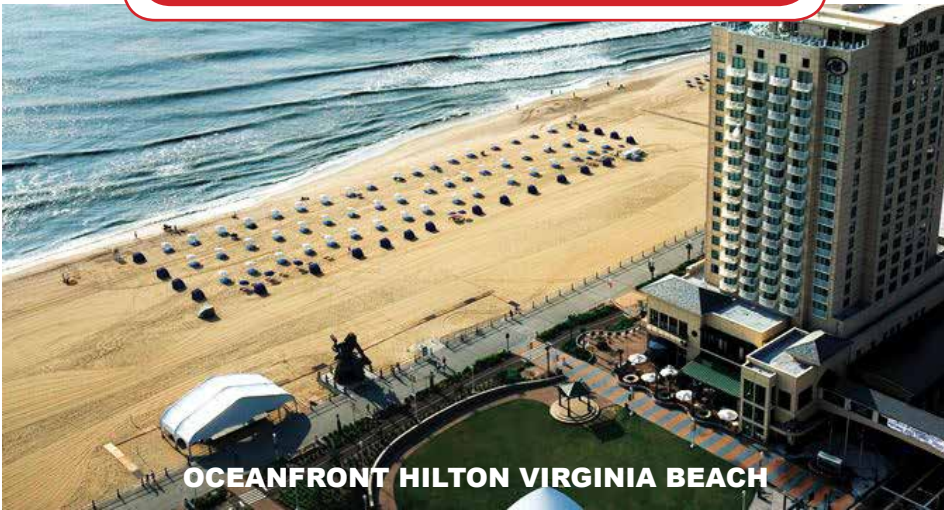
OCEANFRONT HILTON VIRGINIA BEACH